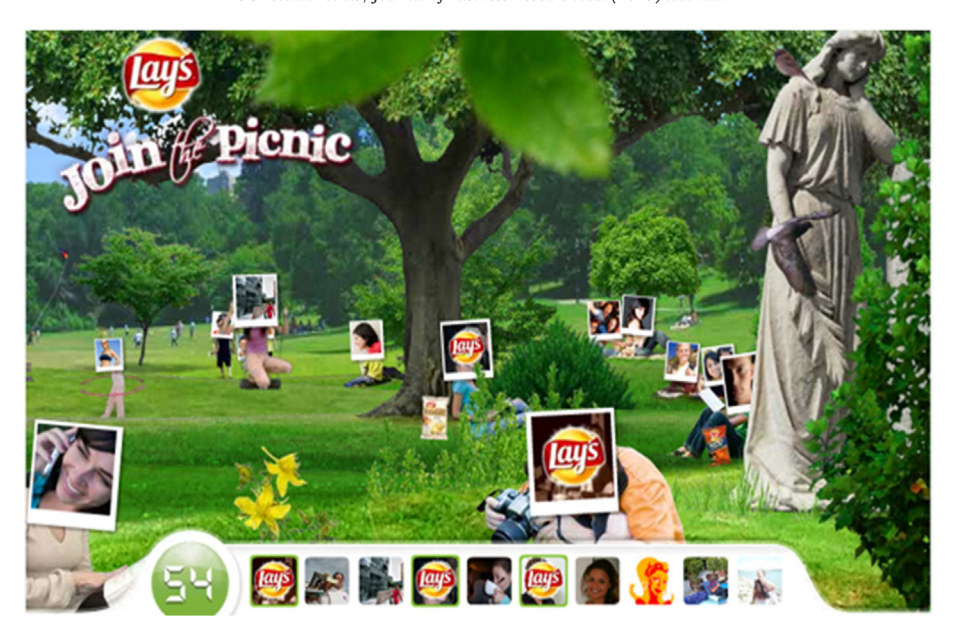
Fig. 2. Lay's"Join the Picnic" advertisement.

1.10), this construct was not used as a linear variable in the analyses, but a dichotomous variable was created, indicating daily use or non-daily use.