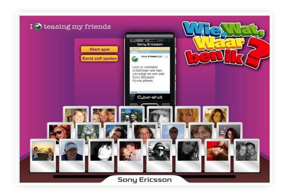
Fig. 4. Sony Ericsson's "who, what, where am I?" advertisement.